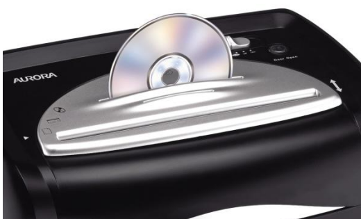
Adjustable cover for CD and Credit card shredding