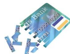
Shreds credit cards