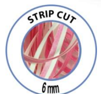
Security Level P2