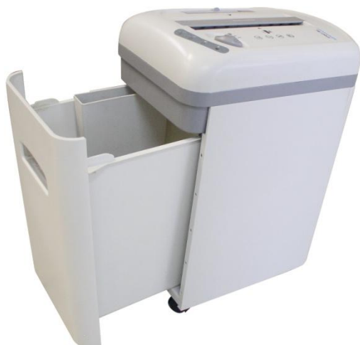
Compact desk side design and pull out waste bin