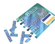
Shreds credit cards