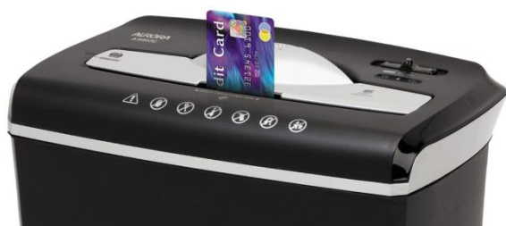
Ideal for securely disposing of expired credit cards